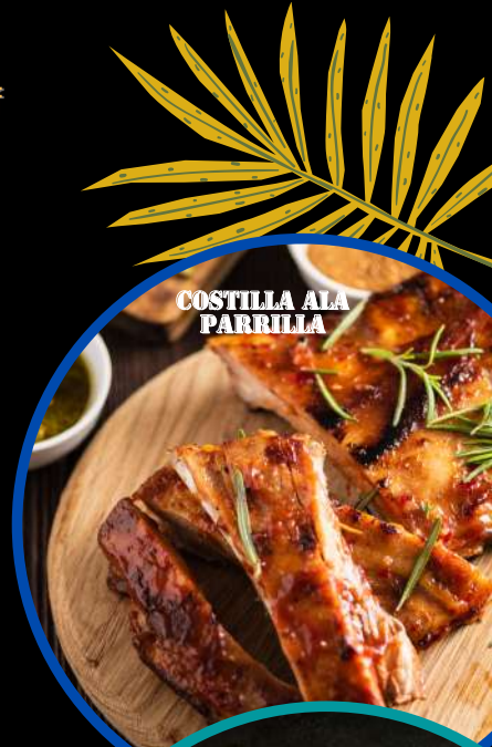
COSTILLA ALA PARRILLA