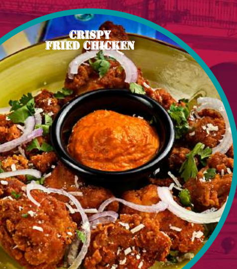
CRISPY FRIED CHICKEN