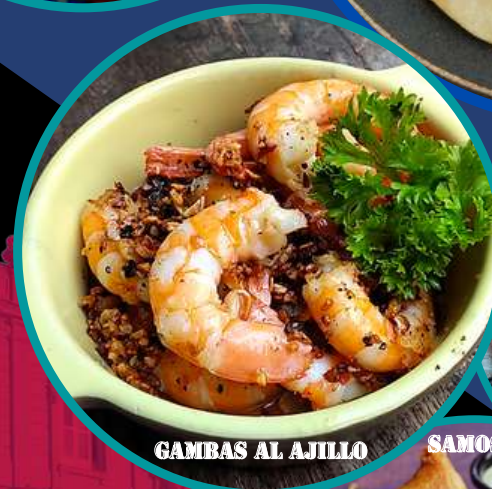
GAMBAS AL AJILLO